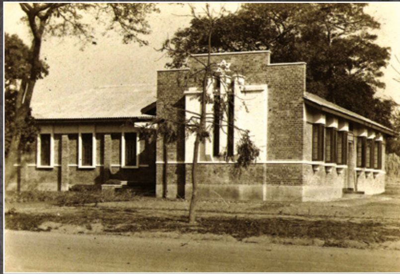
The Mufulira synagogue