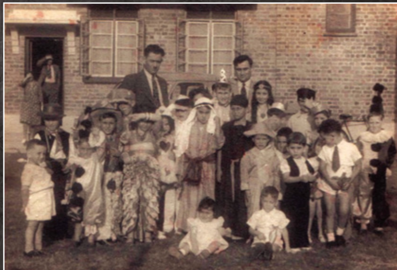
Children's play at Mufulira synagogue, circa 1950