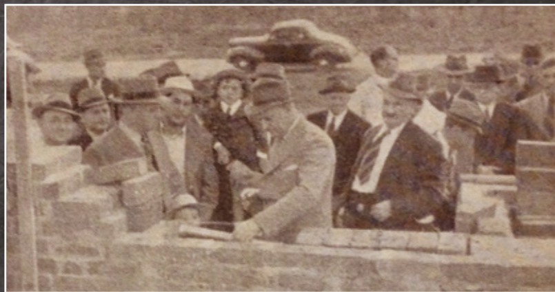
Placing a time capsule at the time of the consecration of the Mufulira Synagogue 1946